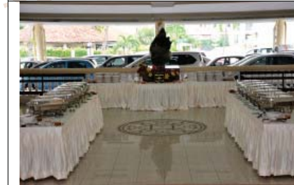
Outdoor catering profiles